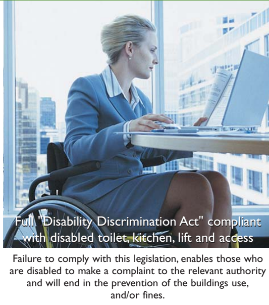
Full "Disability Discrimination Act" compliant with disabled toilet, kitchen, lift and access

Failure to comply with this legislation, enables those who are disabled to make a complaint to the relevant authority and will end in the prevention of the buildings use, and/or fines.