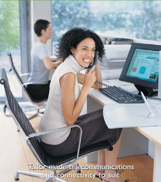
Tailor made telecommunications and connectivity to suit