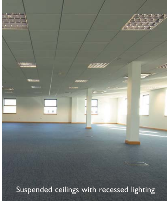
Suspended ceilings with recessed lighting