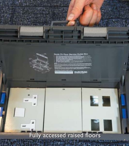
Fully accessed raised floors