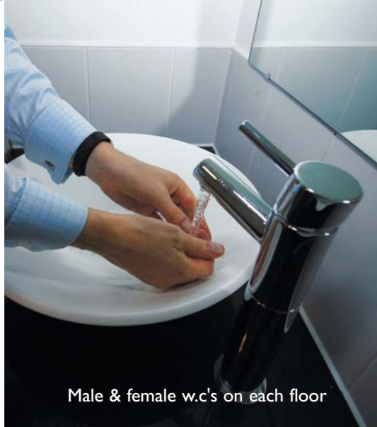
Male & female w.c's on each floor