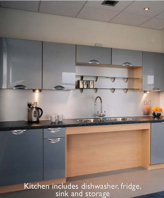
Kitchen includes dishwasher, fridge, sink and storage