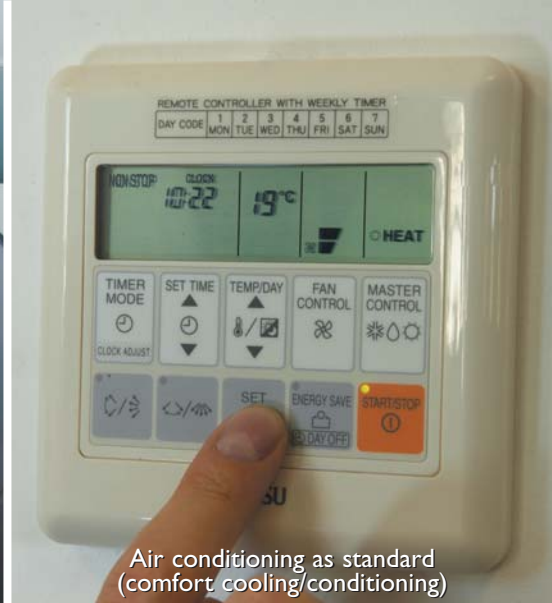
Air conditioning as standard (comfort cooling/conditioning)