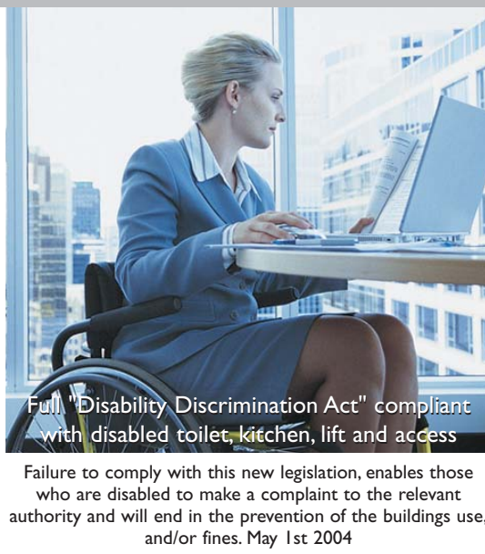
Full "Disability Discrimination Act" compliant with disabled toilet, kitchen, lift and access

Failure to comply with this new legislation, enables those who are disabled to make a complaint to the relevant authority and will end in the prevention of the buildings use, and/or fines. May 1st 2004