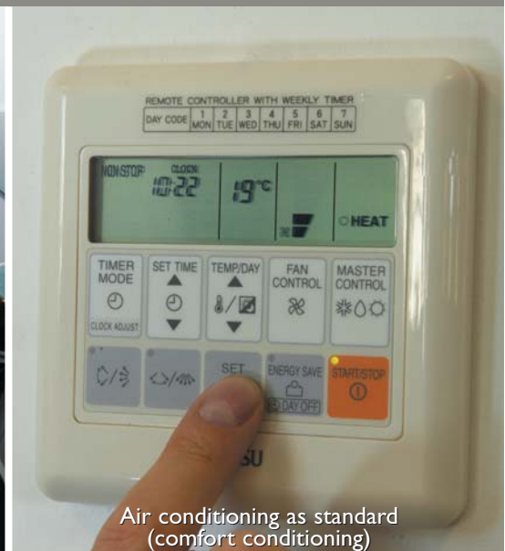
Air conditioning as standard (comfort conditioning)