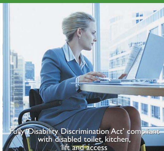
Fully 'Disability Discrimination Act' compliant with disabled toilet, kitchen, lift and access

Failure to comply with this new legislation, enables those who are disabled to make a complaint to the relevant authority and will end in the prevention of the buildings use, and/or fines. May 1st 2004