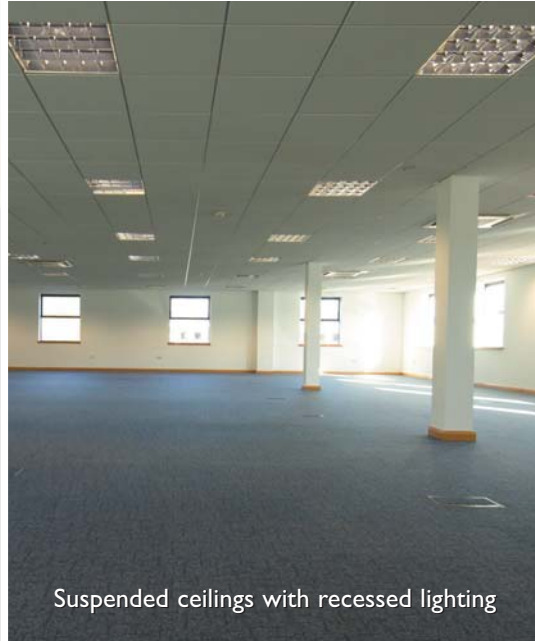
Suspended ceilings with recessed lighting