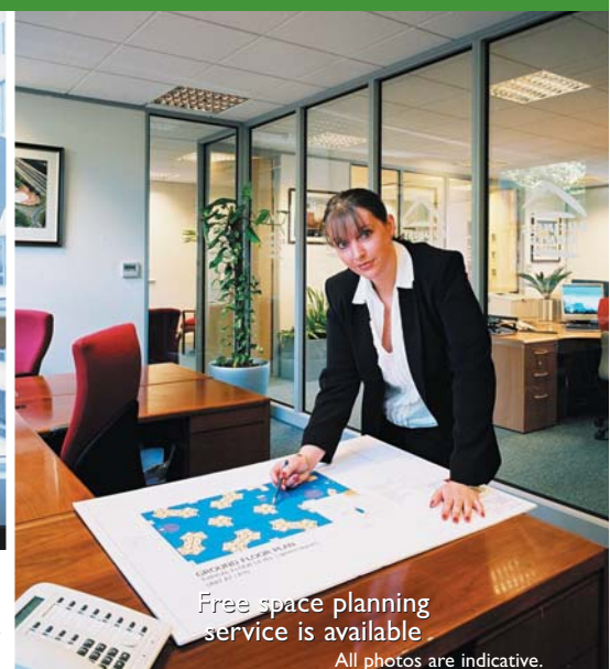
Free space planning service is available

Failure to comply with this new legislation, enables those who are disabled to make a complaint to the relevant authority and will end in the prevention of the buildings use, and/or fines. May 1st 2004