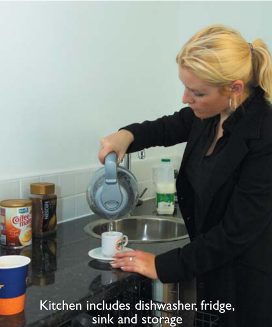
Kitchen includes dishwasher, fridge, sink and storage