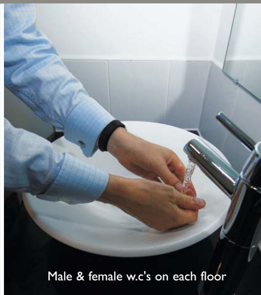
Male & female w.c's on each floor