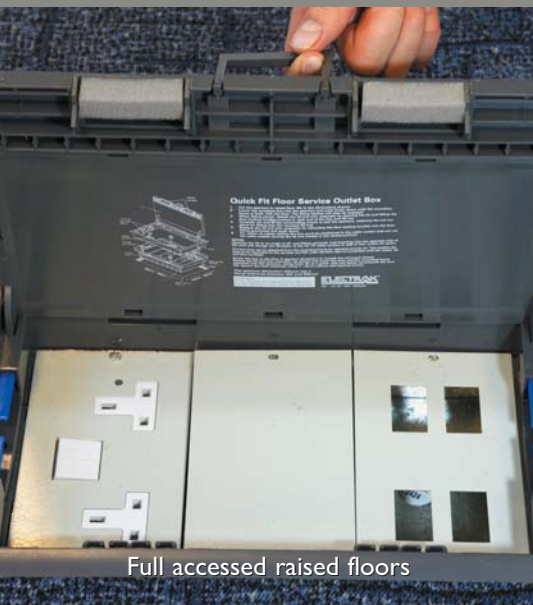
Full accessed raised floors